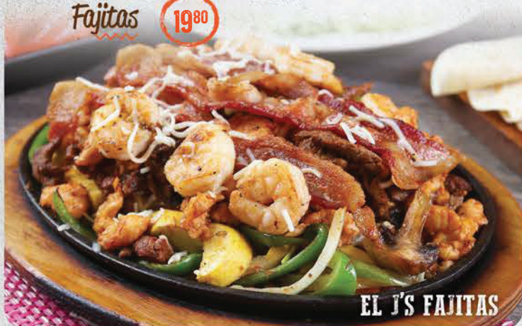
EL J'S FAJITAS